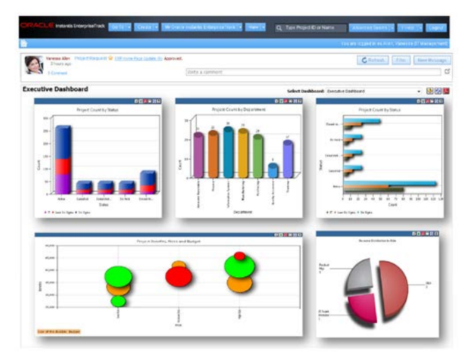
Figure 1. Dashboards aggregate and present key metrics in an intuitive fashion.